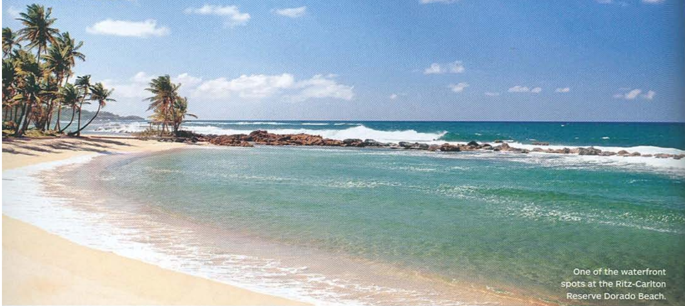
One of the waterfront spots at the Ritz-Carlton Reserve Dorado Beach.